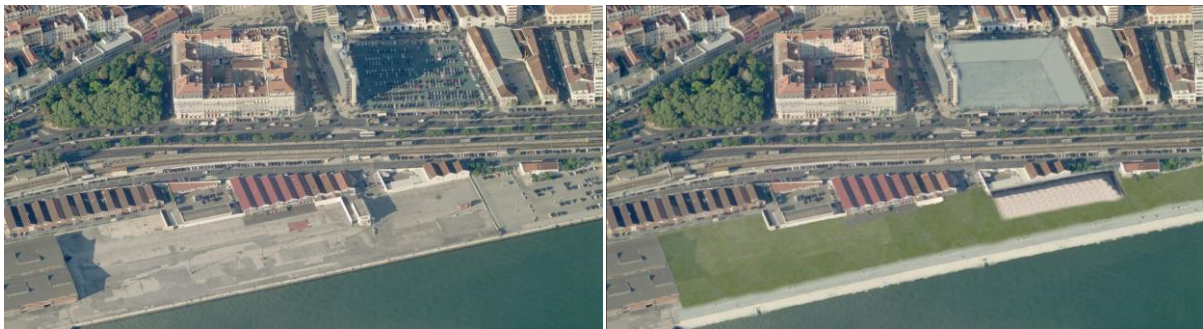
Figure 8 | Actual aerial picture and photomontage

The second proposal is located between in the Santos area and the riverfront, rehabilitating these areas, which are presently used as car parks.