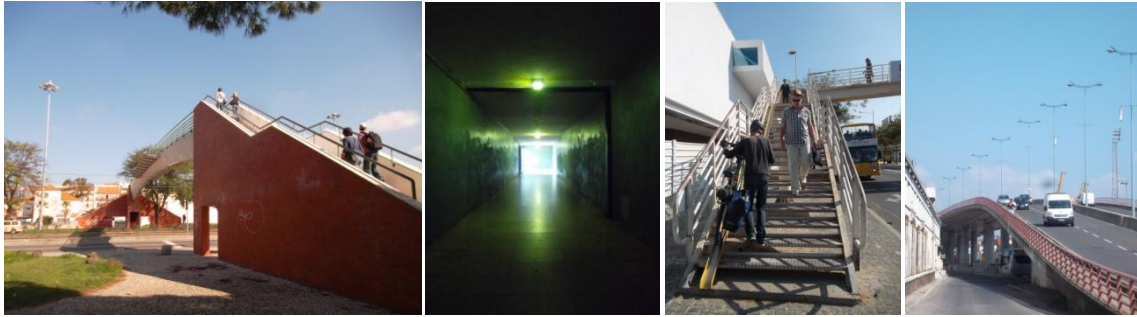
Figure 2 | Illustrative images of the passages.