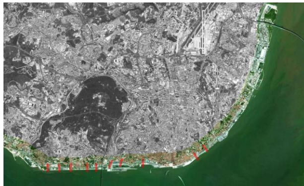
Figure 1 | Location of existing walkways

There are currently 10 pedestrian crossings, by tunnel or bridge, to overcome the road and railway barrier that extends throughout the riverfront, interrupted only between the Cais do Sodré and the Santa Apolónia Station and the Parque das Nações area. Three passages are in the tunnel while the remaining seven passes are made through bridges. The majority of these passages are located in the area between Belém and Alcântara (Figure 1).