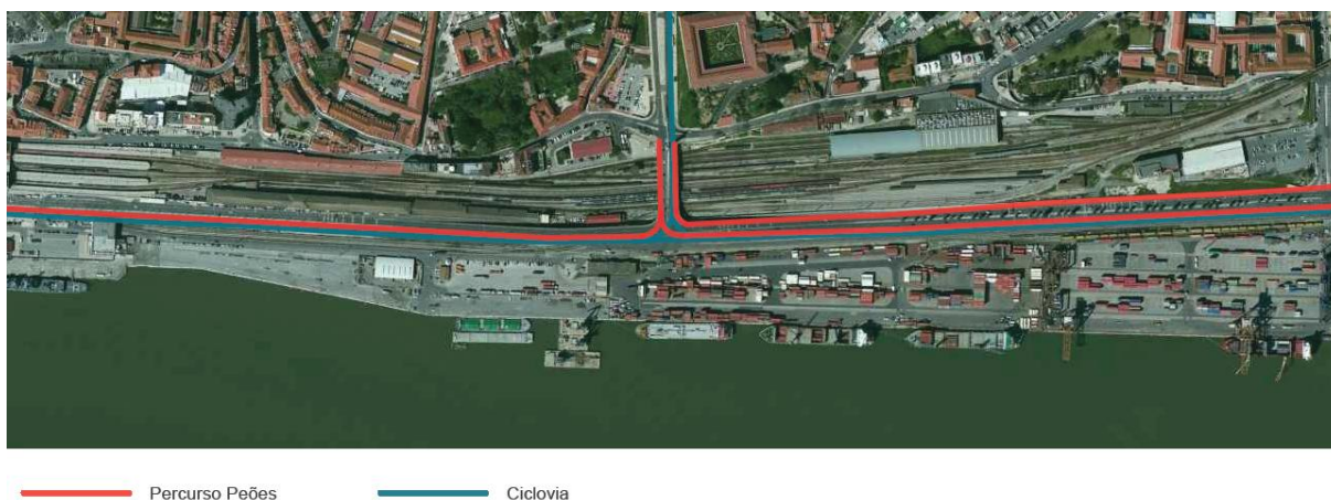
Figure 6 | Suggested pedestrian pathway and bike lane scheme

For the new proposals, it is intended that these become integrated in the landscape and promote new spaces, with more than one quality, becoming more than just crossings.